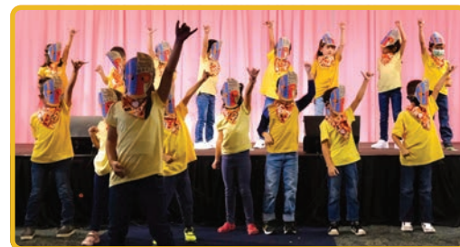
The Hongwanji Keiki Chorus performed songs from the beloved TV series during the "KIKAI DA FOREVER!" showcase in the JCCH's Generations Ballroom.