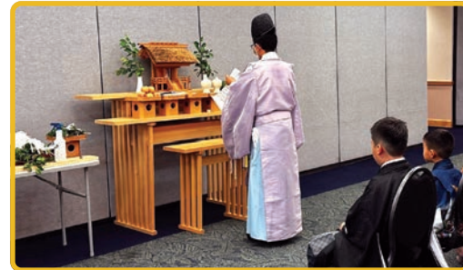
Two boys dressed for their Shichi Go San photo session received a traditional Shinto children's blessing for health and well-being by a priest from Izumo Taishakyo Mission.