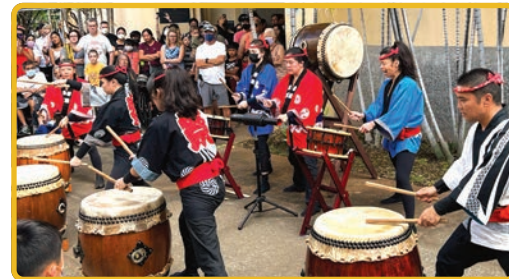
Ryugen Taiko performed in the middle of our courtyard at the 2023 New Year's 'Ohana Festival presented by We Can Do This.