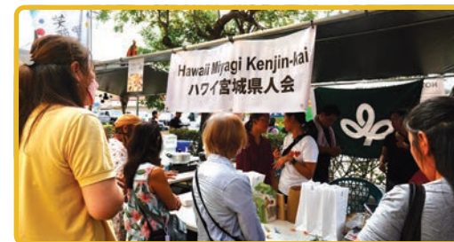
Every year, we invite the kenjinkai groups to participate in the New Year's 'Ohana Festival as an opportunity to fundraise for their organizations. The Hawaii Miyagi Kenjin-Kai sold traditional Japanese foods including imoni soup, zunda mochi, and sekihan.