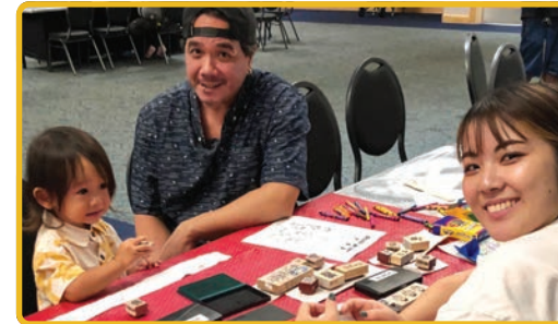
A volunteer in the keiki activities area assisted a family at the hachimaki (headband) stamping activity while they waited for their Shichi Go San photo session.