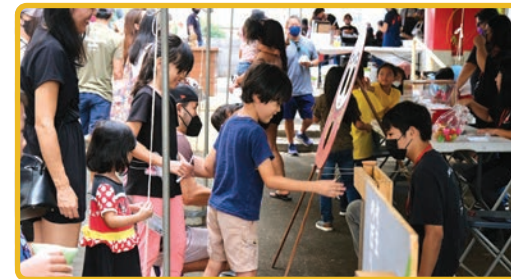
Families and keiki played fun games in our courtyard including daruma toss, leap frog, and pachinko. Their goal was to fill their stamp cards at each station to redeem for a special prize!